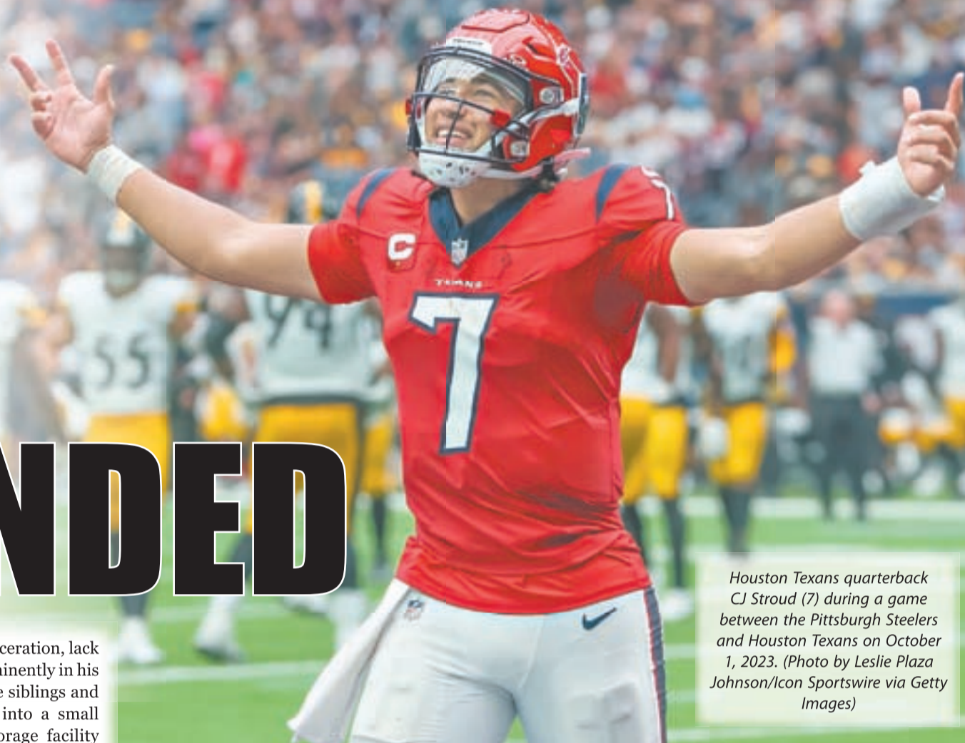
Houston Texans quarterback CJ Stroud (7) during a game between the Pittsburgh Steelers and Houston Texans on October 1, 2023.