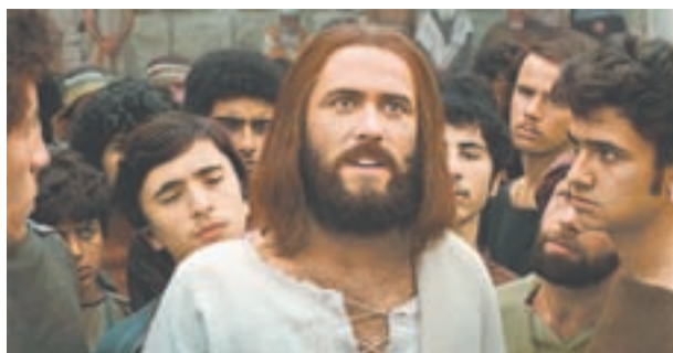
Brian Deacon as Jesus in The Jesus Film .

The film was released in 1980 and shown in about 300 theatres. Paul then worked with Cru staff to translate the film into 21 languages