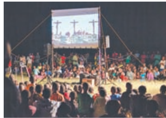
The Jesus Film is shown to communities around the world in a variety of languages.

You can watch The Jesus Film in a variety of languages for free at www.jesusthefilm.org/watch .