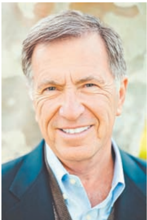
The Jesus Film producer Paul Eshleman.

"I couldn't read; I tried to watch television and I couldn't," Paul