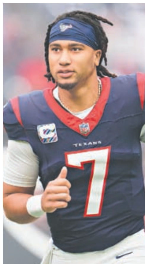
CJ Stroud #7 of the Houston Texans before kickoff against the New Orleans Saints at NRG Stadium on October 15, 2023 in Houston, Texas.

The original of this story can be found at godreports.com and it is used with kind permission.