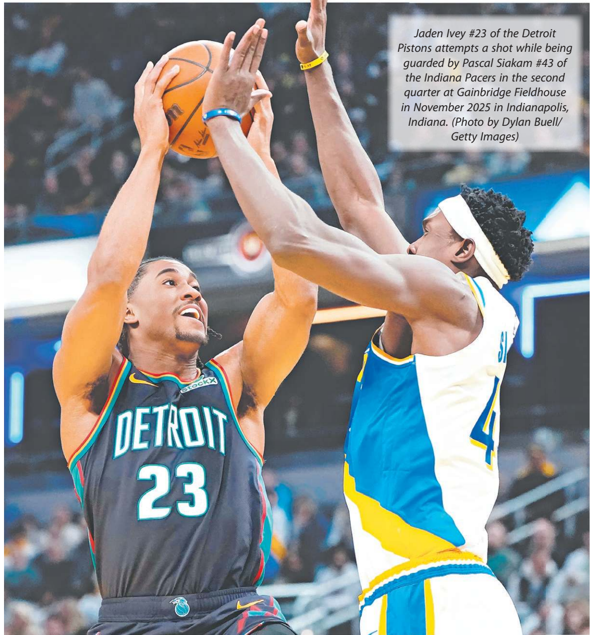
Jaden Ivey #23 of the Detroit Pistons attempts a shot while being guarded by Pascal Siakam #43 of the Indiana Pacers in the second quarter at Gainbridge Fieldhouse in November 2025 in Indianapolis, Indiana.

“ I have that joy that I've been searching for my entire life. ”