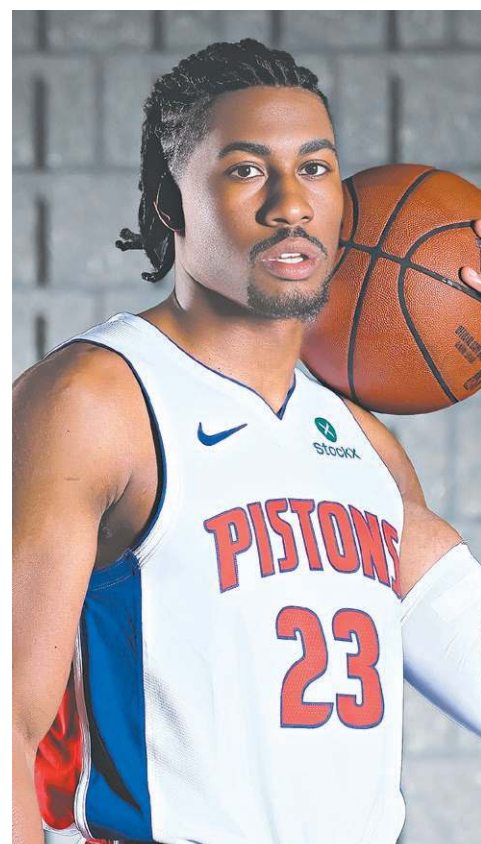
Jaden Ivey of the Detroit Pistons in September 2025.

is coming back, and we all have to repent for our sins and we have to put our faith in Jesus. He will come back when you least expect it, and it's time to wake up if you haven't put your faith in Jesus Christ."