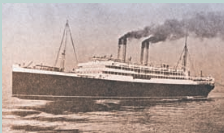
The Empress of Ireland.

THE TRAGEDY OF the sinking of the Titanic is well-known across the world but you may not have heard about another ship, the Empress of Ireland, which sank two years later, in May 1914.