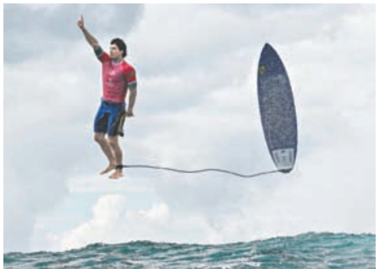
Brazil's Gabriel Medina during the 5th heat of the men's surfing round 3, of the Paris 2024 Olympic Games.

told Premier Christian Radio that he had to find his “own journey with God”. “I thank God every day for getting me through each and every round. Healthy, mentally and physically”, he added.