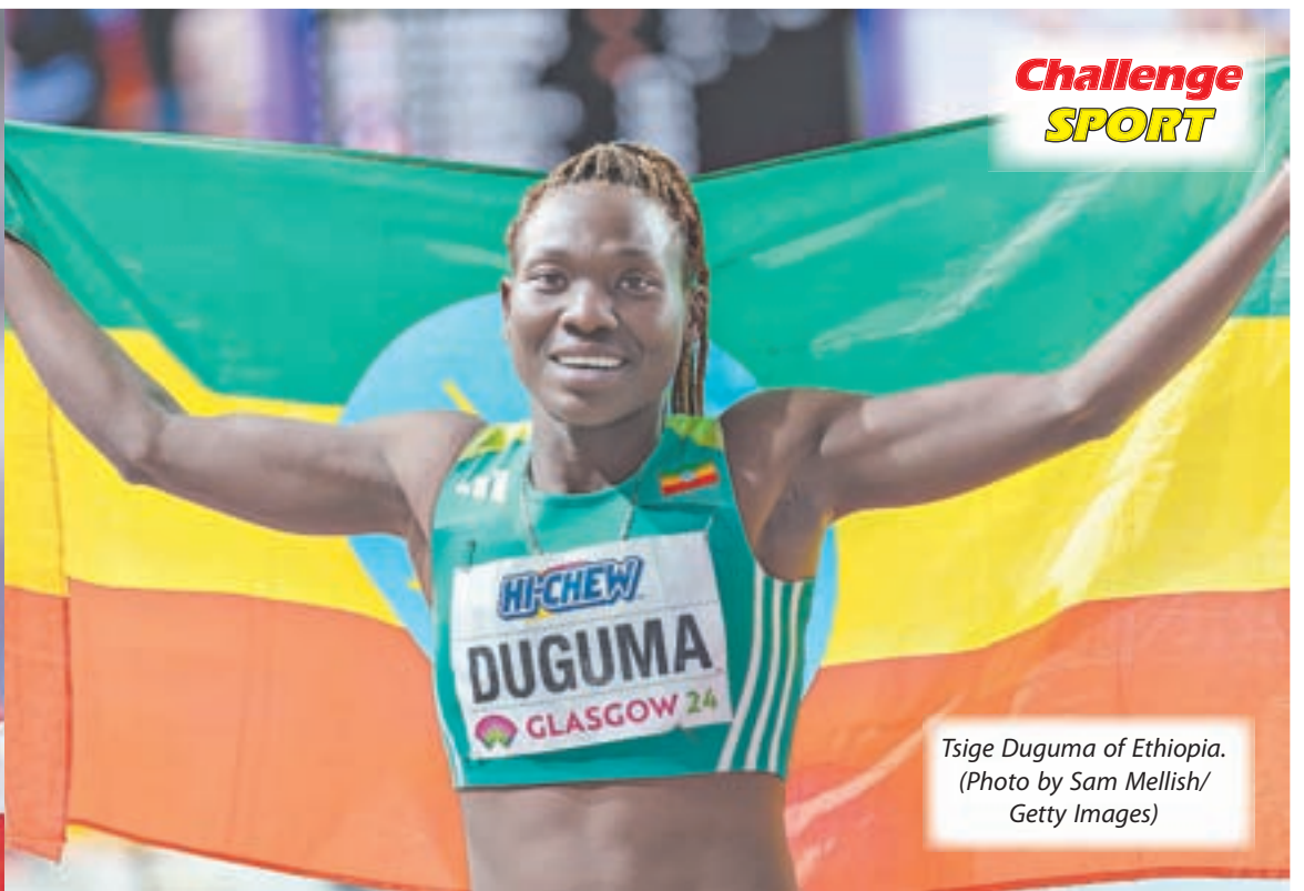
Tsige Duguma of Ethiopia.