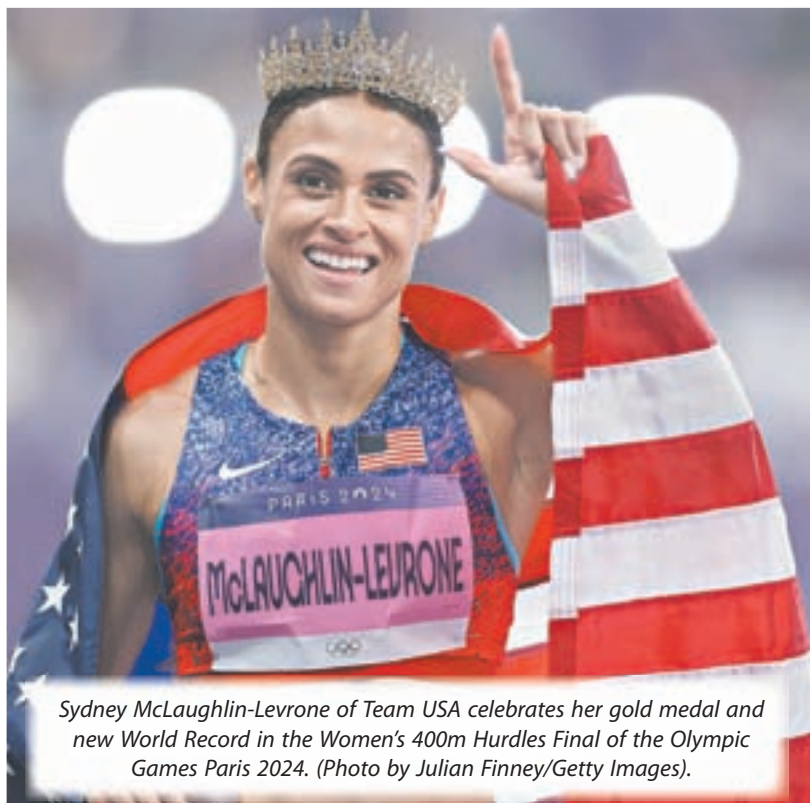
Sydney McLaughlin-Levrone of Team USA celebrates her gold medal and new World Record in the Women's 400m Hurdles Final of the Olympic Games Paris 2024.