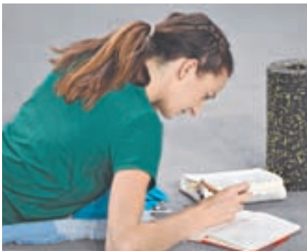
Australian high jumper Nicola Olyslagers reads her Bible and writes in a journal during a competition.

“Win, lose, or draw, it's an opportunity to glorify Him, and my value is already secure in Christ.”