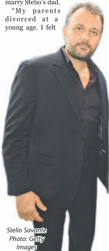
Stelio Savante

"My parents divorced at a young age. I felt