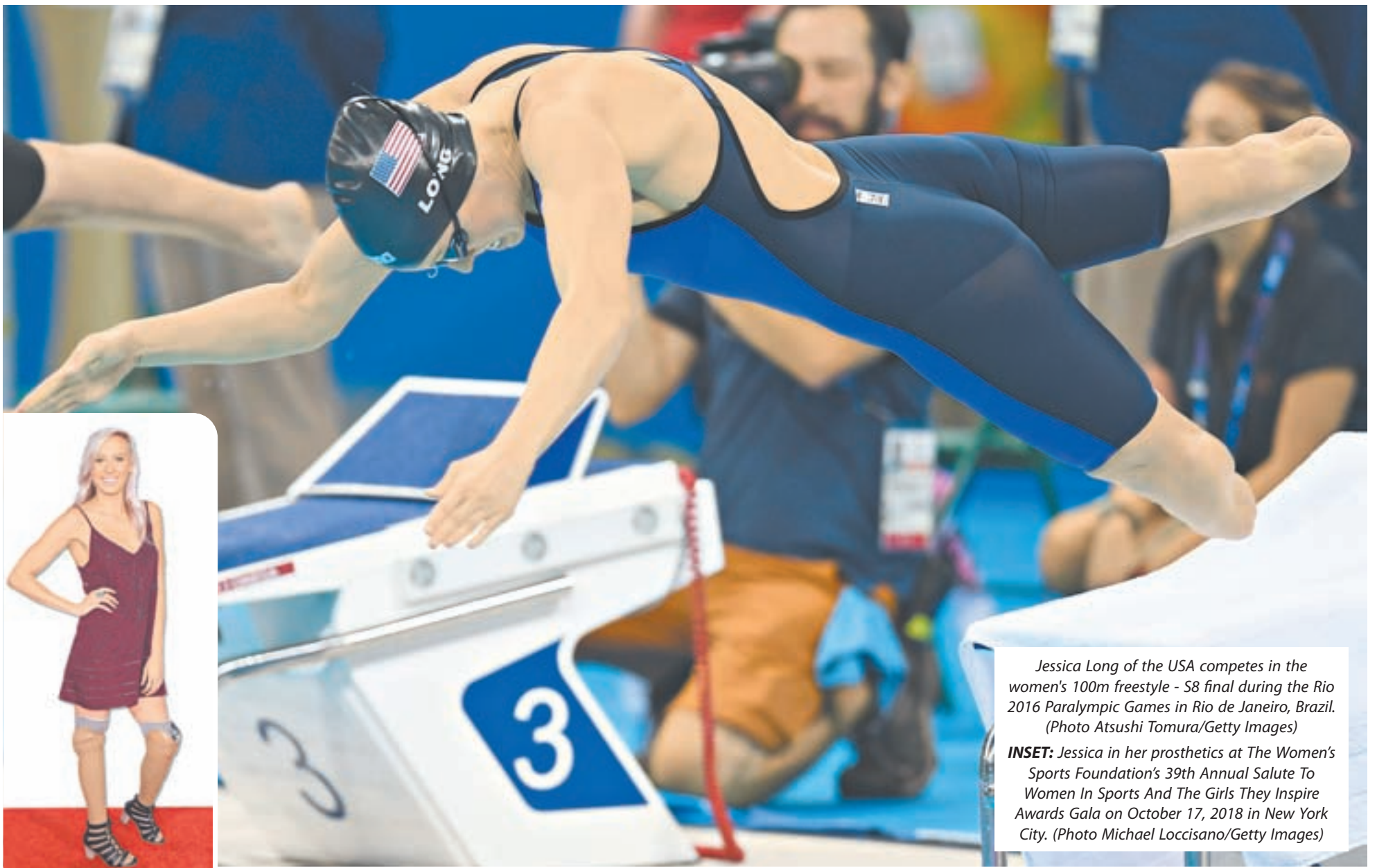
Jessica Long of the USA competes in the women's 100m freestyle - S8 final during the Rio 2016 Paralympic Games in Rio de Janeiro, Brazil. INSET: Jessica in her prosthetics at The Women's Sports Foundation's 39th Annual Salute To Women In Sports And The Girls They Inspire Awards Gala on October 17, 2018 in New York City.