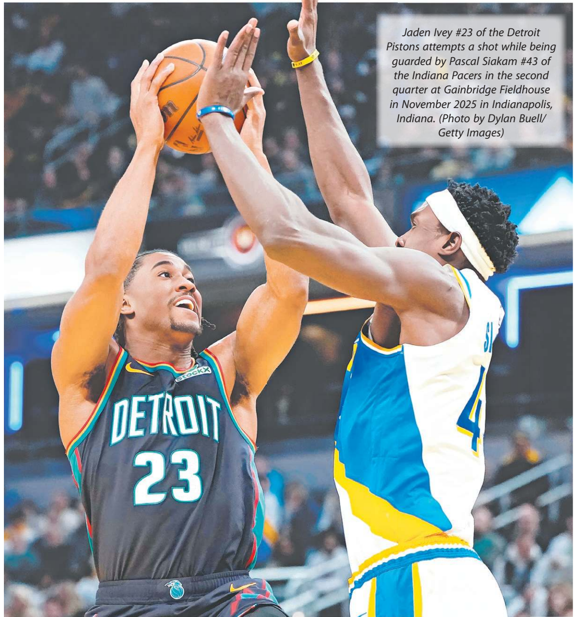
Jaden Ivey #23 of the Detroit Pistons attempts a shot while being guarded by Pascal Siakam #43 of the Indiana Pacers in the second quarter at Gainbridge Fieldhouse in November 2025 in Indianapolis, Indiana.

“ I have that joy that I've been searching for my entire life. ”