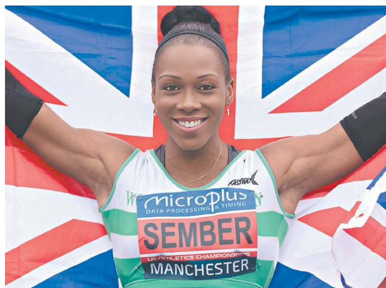
Cindy Sember after winning the 100m hurdles during the Microplus UK Athletics Championships at the Manchester Regional Arena in England in June 2024.

"But I think just being rooted and keeping my eyes fixated on Him, I think that's what kept me going." •