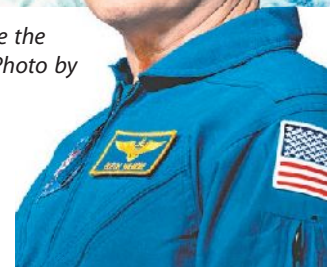
RIGHT: Butch looks on during a news conference at the NASA Johnson Space Center days after returning to Earth in March, 2025 in Houston, Texas.

to atone," he explained. "But [in Christianity], there's nothing man can do as Christ has done it all. He paid the price."