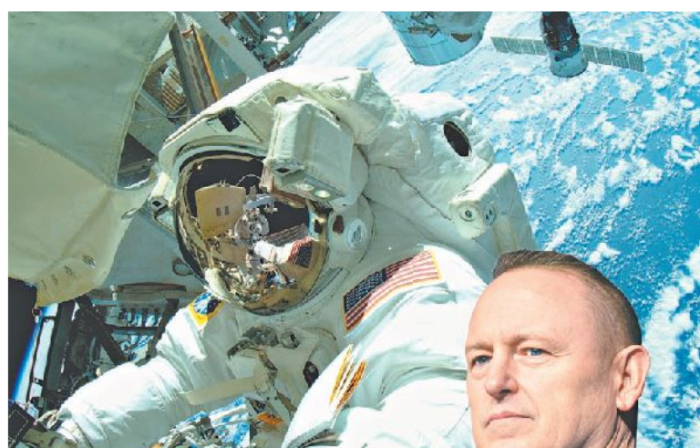
ABOVE: Barry "Butch" Wilmore works outside the International Space Station (ISS) in 2015.

"There's some act, some prayer, something that man's got to do