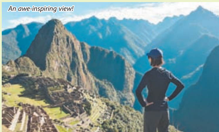
An awe-inspiring view!

“Love without truth is sentimentality; it supports and affirms us but keeps us in denial about our flaws. Truth without love is harshness; it gives us information but in such a way that we cannot really hear it. God’s saving love in Christ, however, is marked by both radical truthfulness about who we are and yet also radical, unconditional commitment to us.” – Timothy Keller