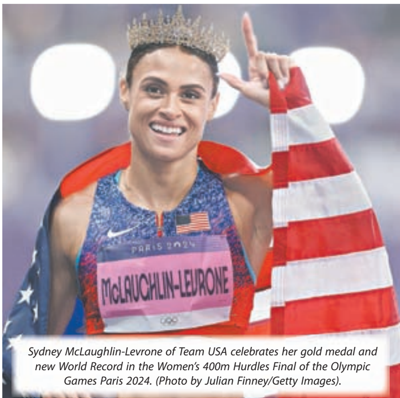
Sydney McLaughlin-Levrone of Team USA celebrates her gold medal and new World Record in the Women's 400m Hurdles Final of the Olympic Games Paris 2024.