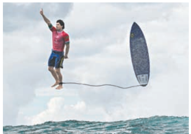
Brazil's Gabriel Medina during the 5th heat of the men's surfing round 3, of the Paris 2024 Olympic Games.

told Premier Christian Radio that he had to find his “own journey with God”. “I thank God every day for getting me through each and every round. Healthy, mentally and physically”, he added.