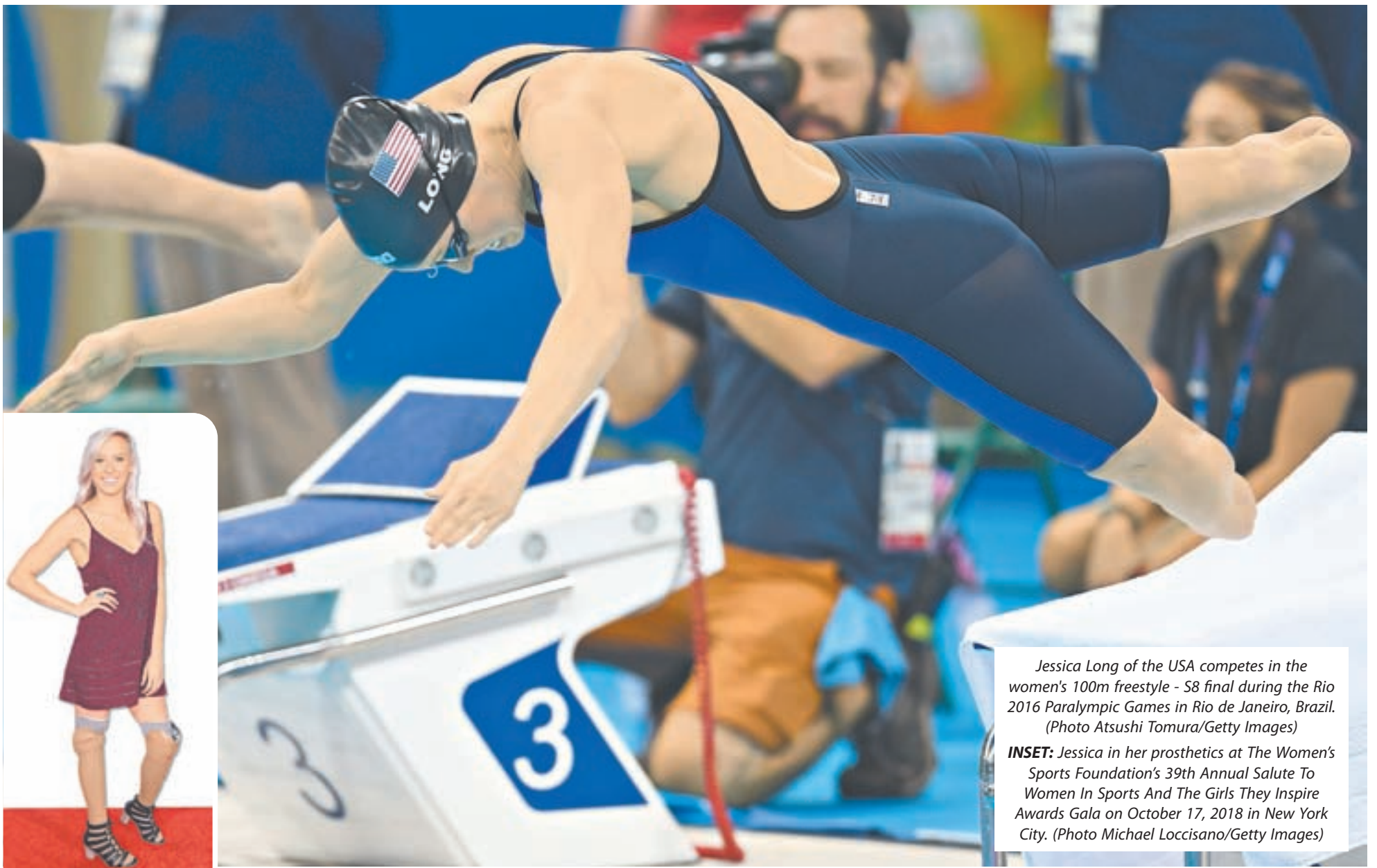
Jessica Long of the USA competes in the women's 100m freestyle - S8 final during the Rio 2016 Paralympic Games in Rio de Janeiro, Brazil. INSET: Jessica in her prosthetics at The Women's Sports Foundation's 39th Annual Salute To Women In Sports And The Girls They Inspire Awards Gala on October 17, 2018 in New York City.