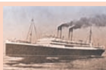
The Empress of Ireland.

Sa biyaya ng Diyos at sa kanyang matibay na pananampalataya, nakapagtapos siya ng kursong Bach-